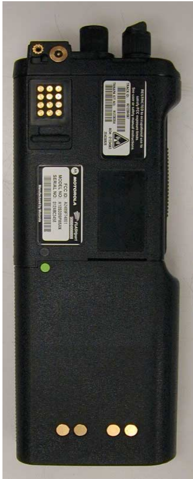
BACK VIEW (FCC LABELS)