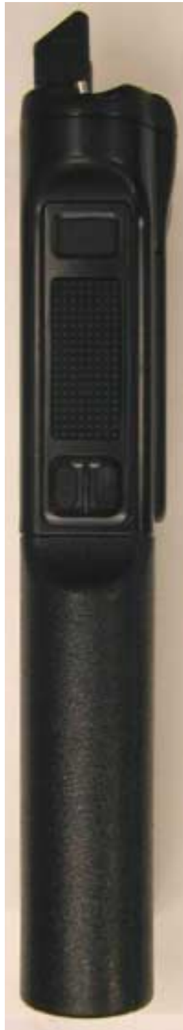
SIDE VIEW (LEFT)