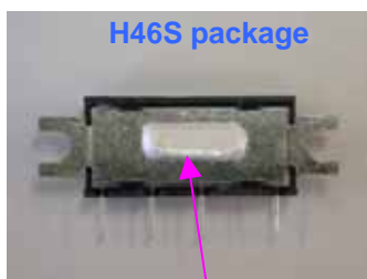
Thermal compound size: L10 x W3.0 x t 0.5mm