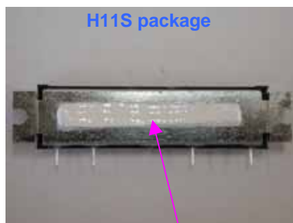
Thermal compound size: L40 x W5.0 x t 0.5mm